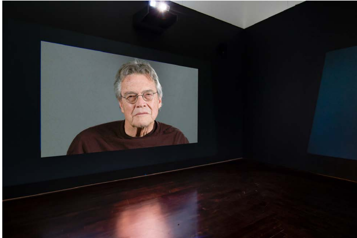
Terry Allen Wichita, Kansas, 1943–Santa Fe, New Mexico, present MemWars , 2016 Three-channel video projection with sound, 1:22:28 Dimensions variable