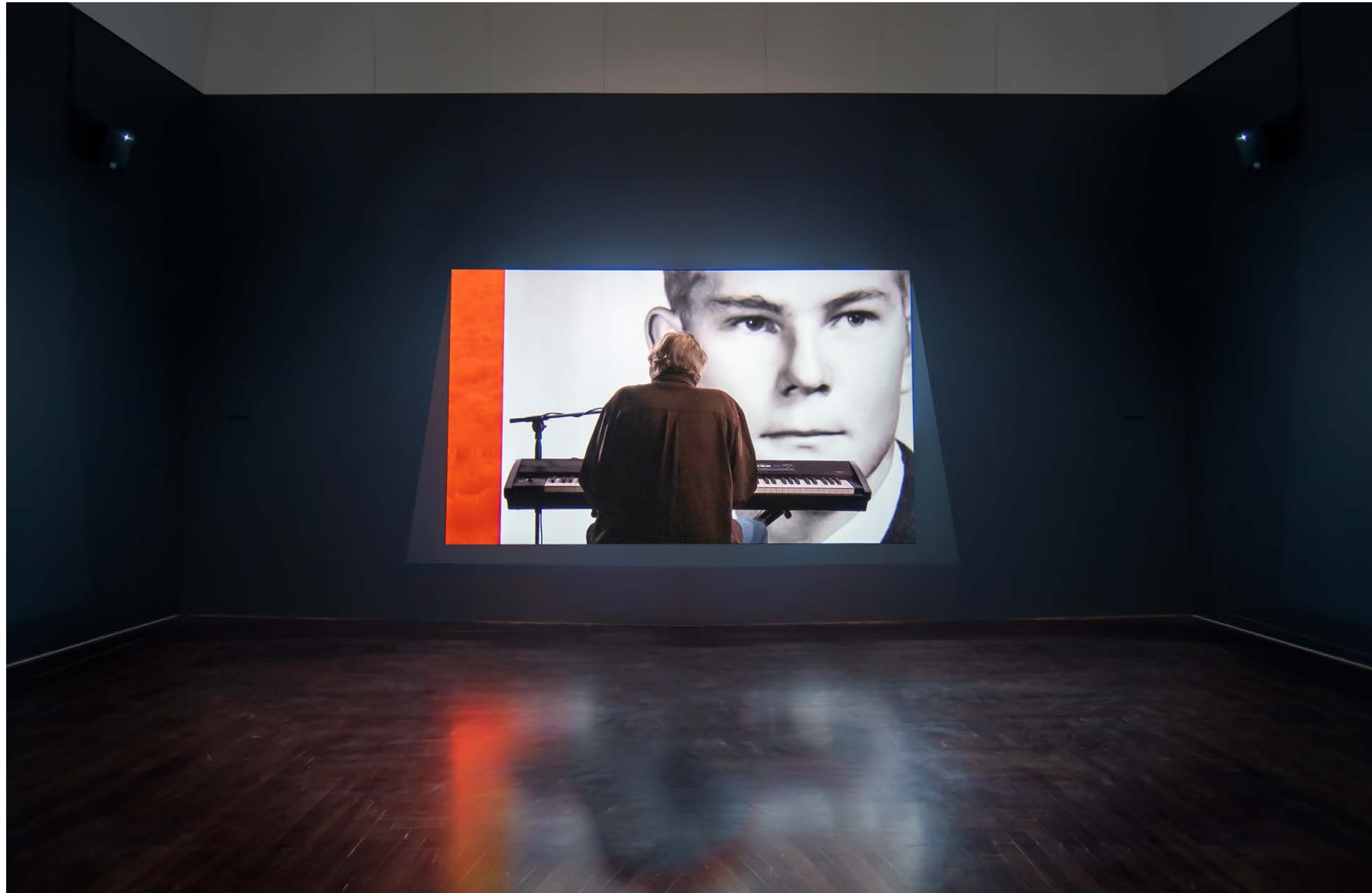
Terry Allen Wichita, Kansas, 1943–Santa Fe, New Mexico, present MemWars , 2016 Three-channel video projection with sound, 1:22:28 Dimensions variable