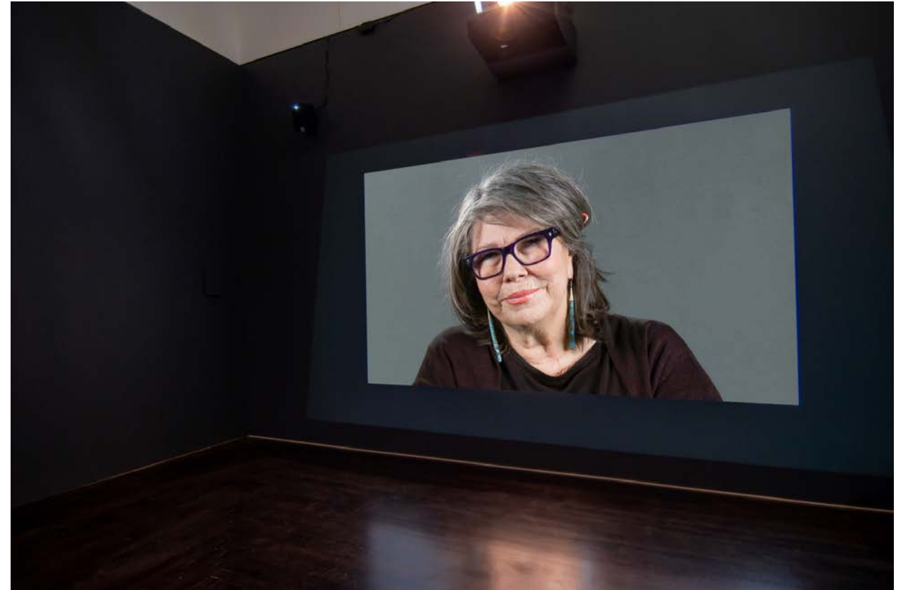
Terry Allen Wichita, Kansas, 1943–Santa Fe, New Mexico, present MemWars , 2016 Three-channel video projection with sound, 1:22:28 Dimensions variable